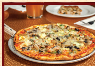
Lake Shore Drive Veggie