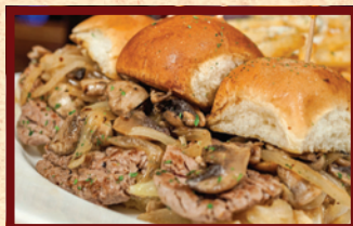
Filet Mignon Sliders