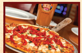
Uptown Roasted Garlic Chicken