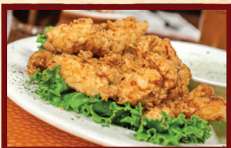
Chicken Breast Tenders